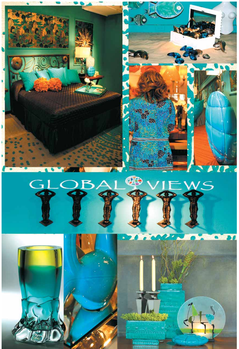
This photo montage of designs from the Global Views booth at High Point displays the variety and use of greens and blues indicative of the latest 2010 OEM products, designs, and colors.