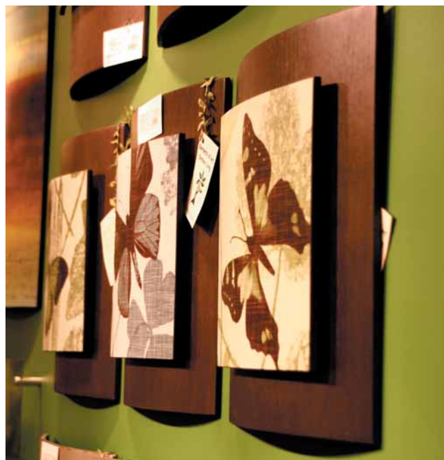
Both the art and the board it is mounted on are curved in these designs from Paragon, adding a strong sense of dimensionality to weather-proofed pieces that were created for outdoor living.