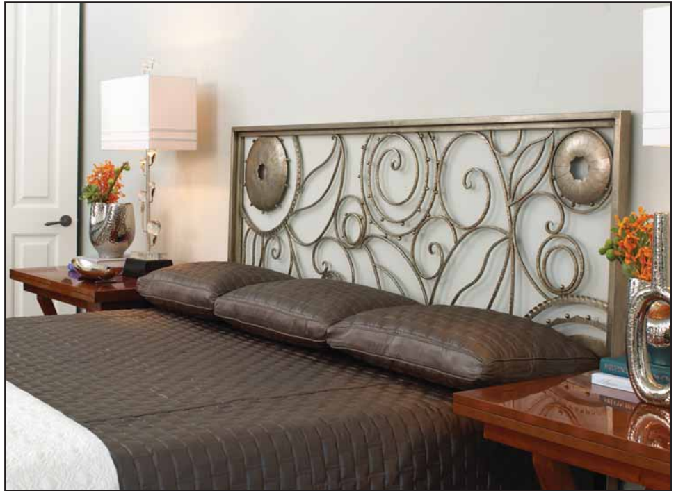
An Art Nouveau period metal headboard, which incorporates a framed image design of its own, is well-matched with cocoa-colored bedding.

There is a new and more classified form of art being framed by OEMs today. The look is more dimensional and protrudes from the frame. There are bent, bowed, and S-shaped media as well as lots of texture and vivid color. For example, Mercana Art Decor and Paragon showed lots of texture and dimensional art pieces at the