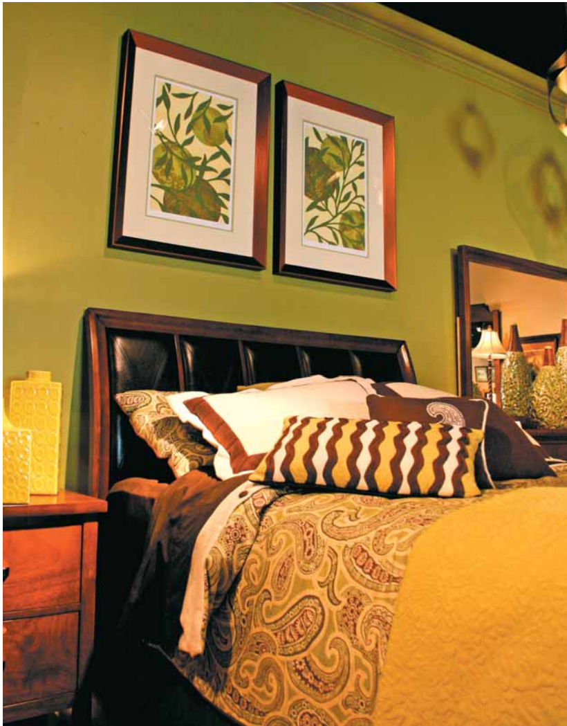
Tone-on-tone art, in which image colors are tailored to match walls and accessories, are being promoted by more OEMs in an effort to provide framed images that blend with furniture and surroundings.

sight, clean lines, little ornamentation, and a convergence of contrasting features that evoke yin and yang. Japanese parasols and Chinese paper lanterns are used as art. Chinese scroll painting or Tibetan wall art are used for visual pop. This style generally incorporates a mixed look of exotic woods, texture, deep reds, and blacks.