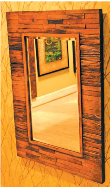
A growing trend is to use recycled and reclaimed wood pieces to create frames, revealing an effective environmental look, as shown by Copper Classics' Blakely mirror.

There are several contributing factors that lend support and guidance to the design of OEM framed art. These factors change with each new trend, such as “Global