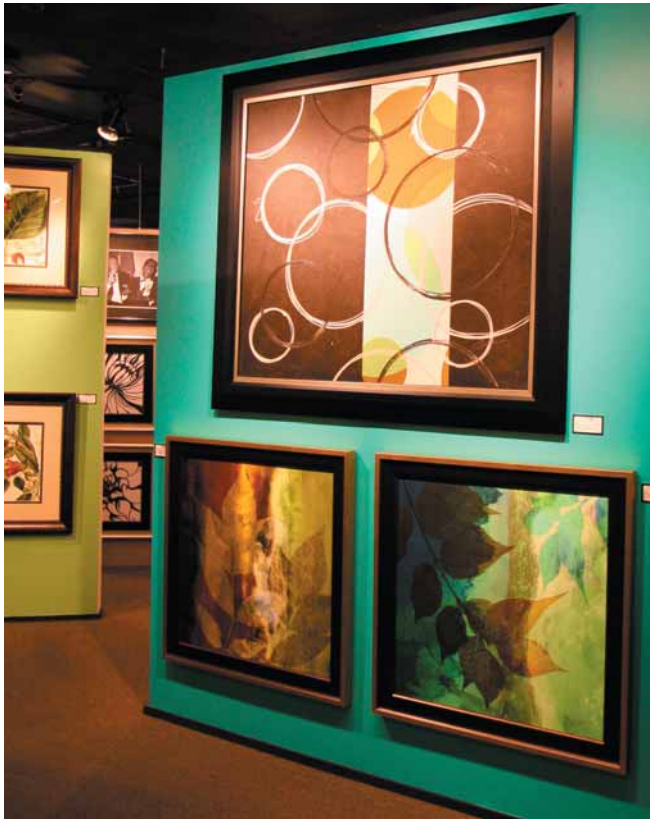
Two popular design themes in wall art today are abstracts with round geometrical shapes and contemporary botanicals, shown here presented in natural wood frames.