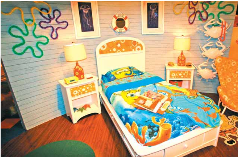
A bedroom from Nick Rooms created by Lea Industries, "Make Room for SpongeBob™," shows a good balance of images and color, including framed underwater jellyfish images, that are popular in today's kids' rooms.