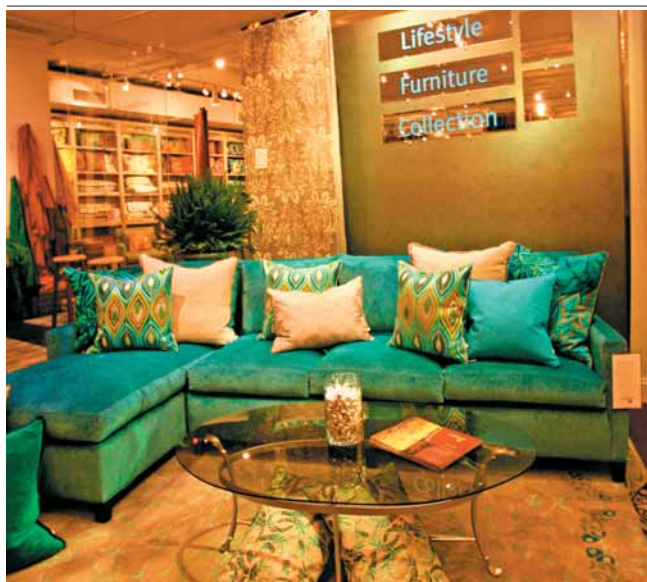
An aqua velvet sofa set with contrasting pillows from Lifestyle Furniture Collection has a satin velvet that offers a great sheen effect, contrasting with aqua greens and blues—colors that are growing in popularity.