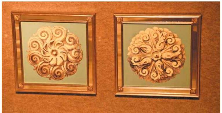
Framed motifs of Baroque rosettes are simple and timeless and are being used quite often in today's room designs.

Pan-Asian Fusion – A wonderful way to blend elements from diverse traditions. Much of Asian design celebrates the beauty of the natural world. Many Asian interiors draw upon the Japanese concept of "sabi," a philosophy that embraces a chic simplicity. Interiors that create this feeling have hidden storage for keeping clutter out of