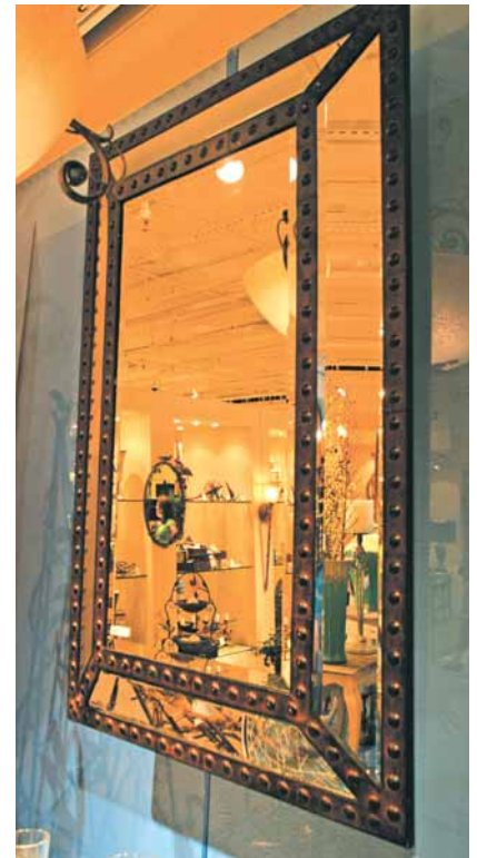
The Merlin rivet mirror from the Cyan Design Co. shows a heavy Medieval metal look that is often seen in large, bold mirror designs.