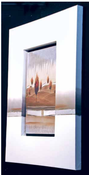
A metal landscape in canvas wrap from Mercana Art Decor extends the image onto the canvas wrap to create a framed image look.

To create a design that will sell, it is necessary to use all the elements and design principles at your disposal in creating the right look, which is a statement about the direction your company will take. Any introduction of a different look can have a significant impact on your market. The amount of research you do on each look you create will make or break your own new introductions. While forecast trends are important, you also need feedback about consumer needs on specific designs and trends if you want buyers to respond positively to your new lines.