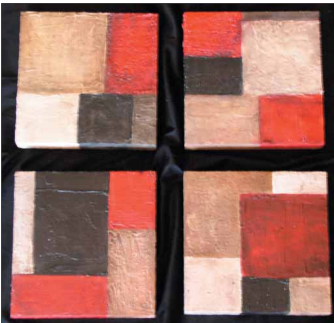
The classic combination of red, white, and black is emerging as a strong trend in all sectors of decor. These paintings on canvas, displayed against black fabric, are from Tre Sorelle Home Designs.

brown with deep colors. Brown is definitely a keeper.