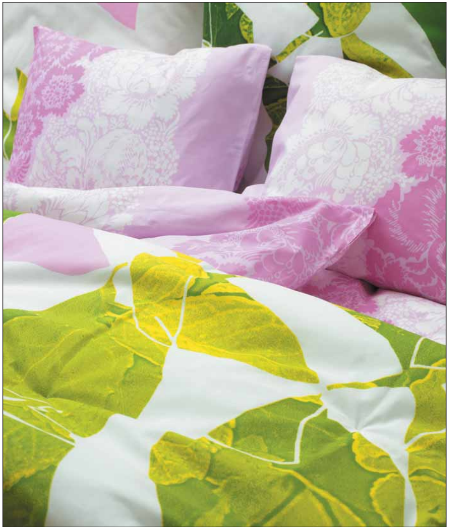
Yellow-greens like the lime in this bedding from Marimekko are part of many current color combinations. Note the block print/silhouette style of the motifs.

Brown continues to be part of many popular color combinations, such as brown with blue, brown with yellow green, brown with orange, brown with turquoise, brown with purple, brown with pale colors, and