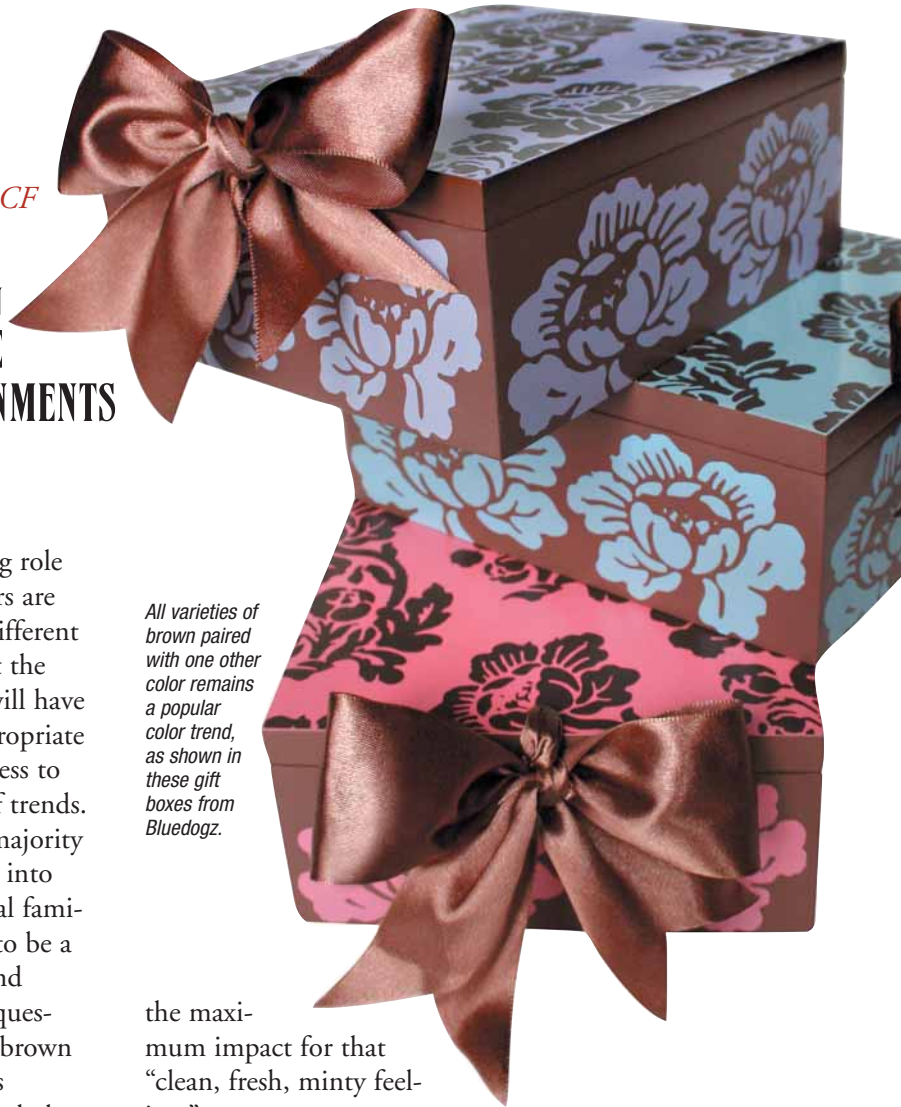
All varieties of brown paired with one other color remains a popular color trend, as shown in these gift boxes from Bluedogz.

Greens, especially yellow-greens, remain popular in all areas of contract as well as residential designs. Darker versions like avocado and olive are being used extensively in fabrics and will be incorporated into artwork for commercial spaces. Lime in all its variations continues to appeal to a wide marketplace as an accent color as well as for open spaces. Mint is fresh and used with white for