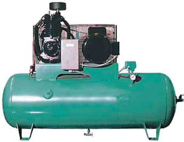
A two-stage model like this 5 HP two-stage compressor, which provides air at 16.5 CFM and 175 PSI and holds 80 gallons, could save money and move air to equipment more efficiently.

be about 1/4" larger than the mentioned size because pipe thread is labeled by the i.d. of the pipe. Since most iron pipes have 1/8" wall, the actual thread is larger by twice that amount.