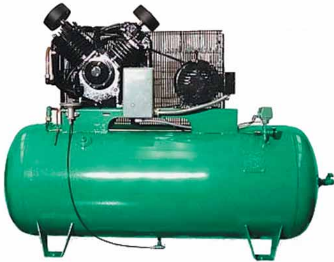
Most framing companies have compressors that are too small, which they run too much and have to be replaced every couple of years. Instead, they should use more efficient compressors like this 10 HP two-stage model that holds 120 gallons of air and provides 34.8 CFM at 175 PSI.

small is like throwing money away. A compressor that's suited to future expansion or one that's rated higher than what you need right now is the best bargain in the long run.