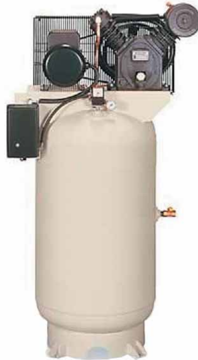
This higher-capacity, two-stage 7.5 HP compressor provides 175 PSI and holds 80 gallons, but at 24 CPF provides a greater volume of air to power more pieces of equipment.

As one expert in the compressed-air business says, "There is no such thing as too large a compressed air line." Installing pipe now that's larger than needed won't hurt a bit and will just add a little storage capacity to the system. All water-related problems arise from using pipes and hoses that are too small, not too large. When you