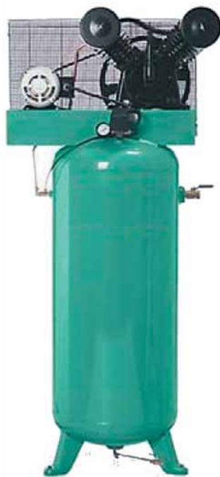
Most production framers have single-stage compressors like this one, which is a 5 HP model that provides 14.2 CFM and 140 PSI and holds 60 or 80 gallons of air.

The first thing to look at in creating an efficient air system is eliminating air lines and hoses that are too small. When an air line is too small for the amount of flow you